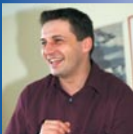
Experienced IB leaders