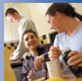
Relaxing in one of the houses

Oxford provides a wealth of historic buildings, galleries, parks and museums as well as plenty of theatres, cinemas and shops.