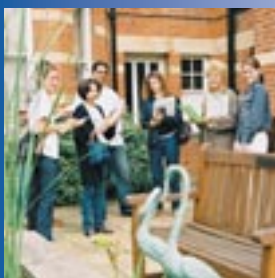
Small, informal groups