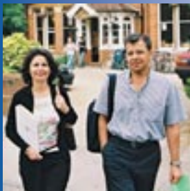
26 years providing the IB