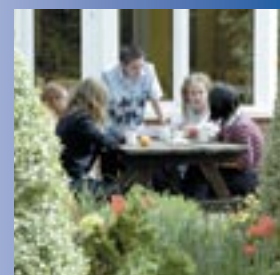
Outside the dining room